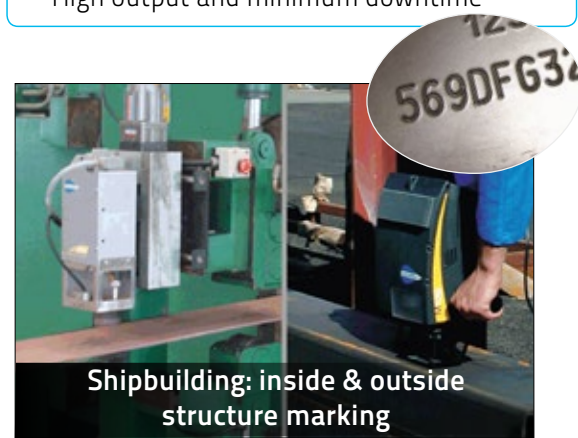
Shipbuilding: inside & outside structure marking

About Technifor... Technifor is the world's first manufacturer of Direct Part Marking machines for quality control, automatic identification and permanent traceability for metallic or plastic parts.